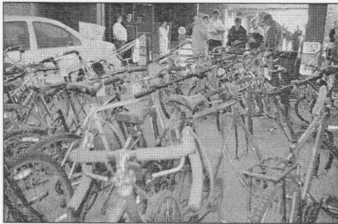
Dozens of bicycles for auction fill the Braintree police garage.

Many people were still willing to bid, if only for the sheer cheapness of what they were getting.